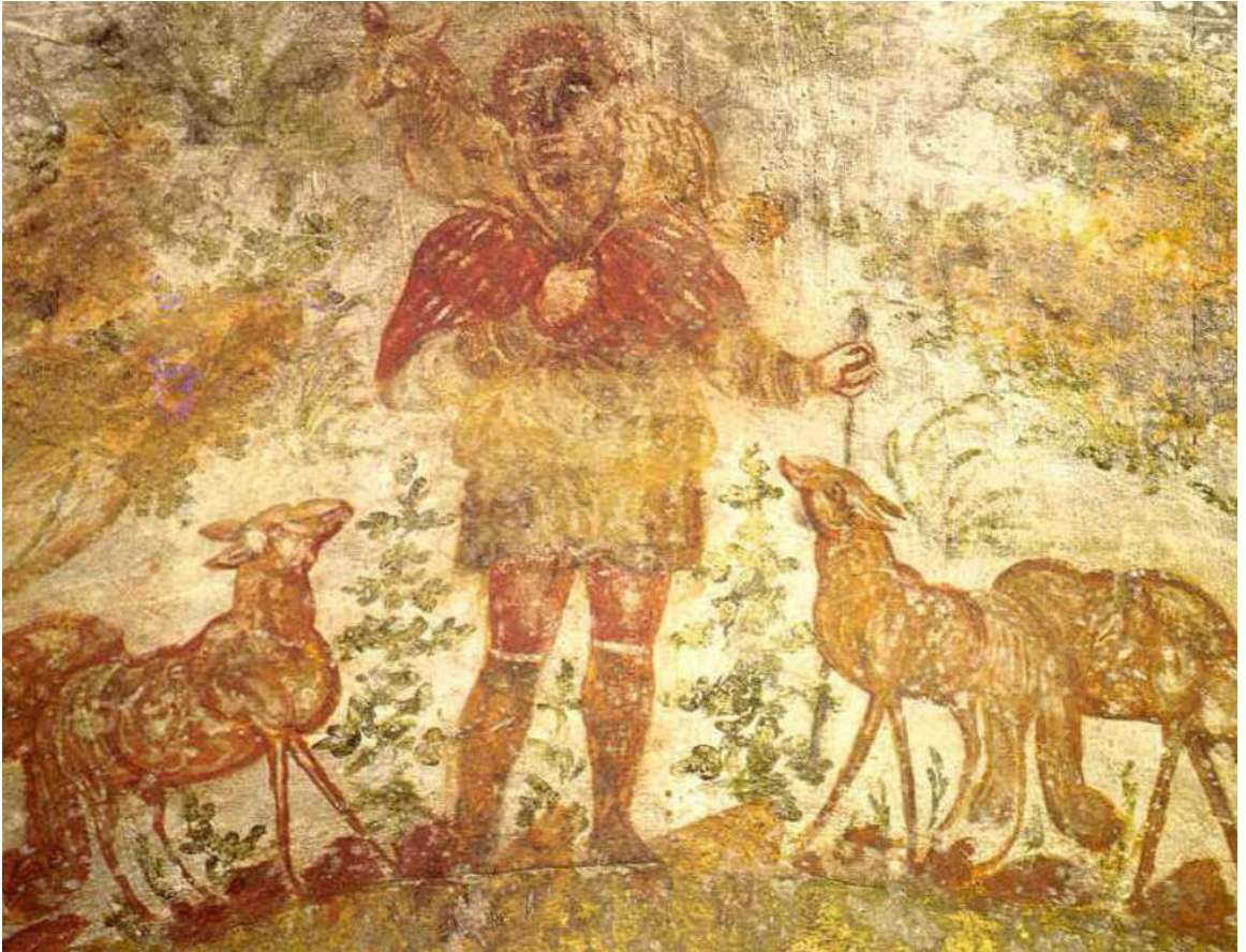
Earliest known depiction of the Good Shepherd, Catacombs of Domatilla, Rome, 2nd Century.